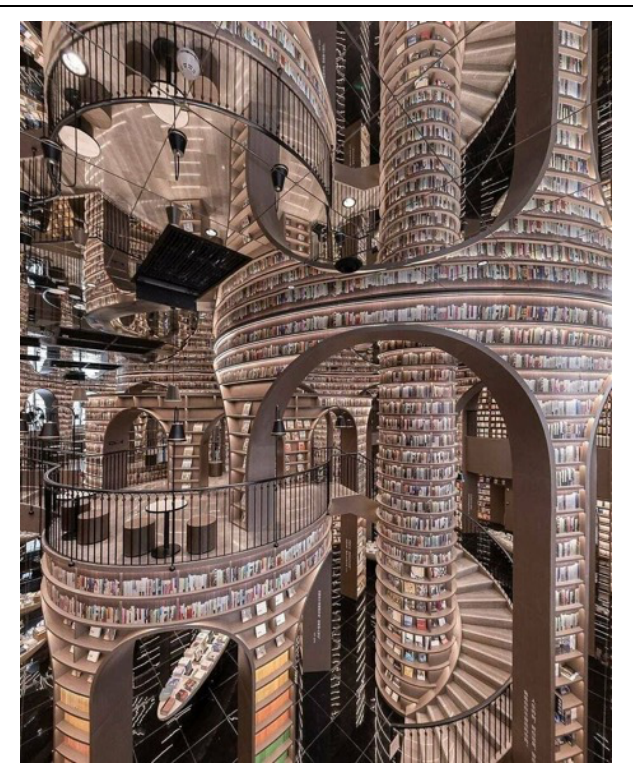
Spellbinding bookstore in Chengdu, Sichuan, China