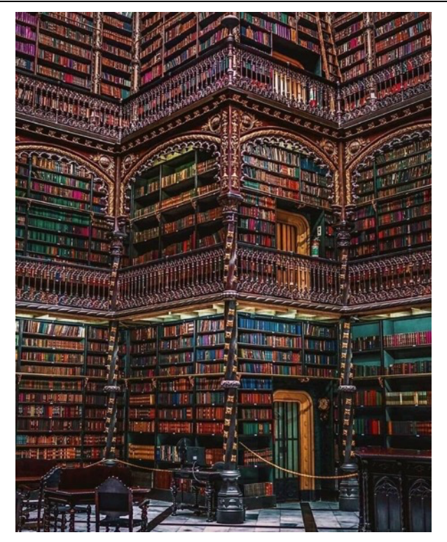
The Reading Room – Royal Portuguese Cabinet Of Reading – Rio De Janeiro, Brazil

BUT - don't forget that we have a really good library at Knox, located in the hall of the Knox Centre. Either take a seat and enjoy reading in the hall, or fill out a borrowing card and take a book home.